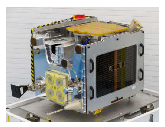
Image 2: TechDemoSat-1 satellite during assembly at SSTL, 2013. Credit SSTL.

Image 1: Image acquired by the inspection camera on board TechDemoSat-1 showing the Icarus-1 sail deployed with a view of Earth beyond. The equipment top left is the satellite's Antenna Pointing Mechanism. Credit SSTL.